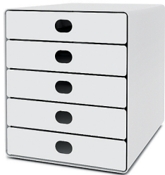
Box with five drawers