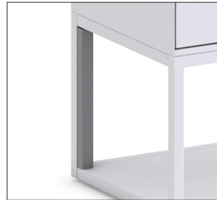
Cable conduit on base