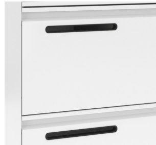
Door with letterbox