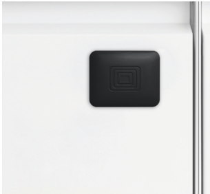
Electronic Closing (battery-supported)

LO Locker offers a range of highly practical optional accessories, such as the integrated power supply that transforms the storage system into a docking station or the code system to prevent other people from gaining access to stored items, plus a pass key and code finder for high ease of use. The LO Locker compartments can be personalised with locker plates and labels.