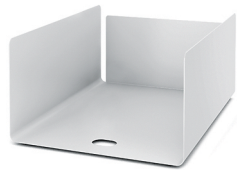
Vertical paper collector