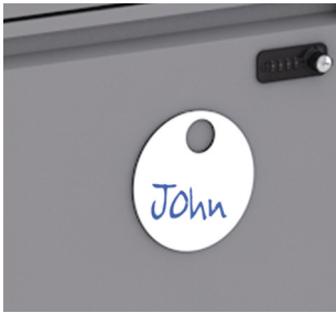
LO Spot locker plate