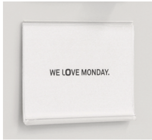
"Business card" label holders